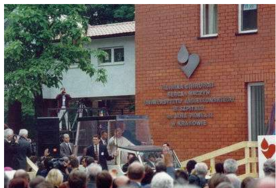
Visit of St. Father John Paul II. in Krakow on June 9, 1997 and the consecration of the clinic